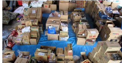
(left) Cherry blossom in full bloom