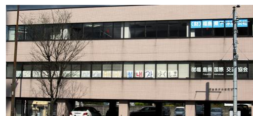
Multi-language slogans on FIA windows