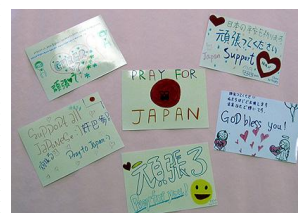
Messages from Taiwan