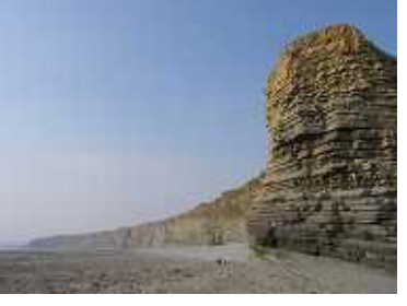
Glamorgan Heritage Coast (Peter Willis)

its surfers and oni no sentakuita (Devil's washboard) so the rocks along the heritage coast have been carved by unrelenting tides resulting in bizarre geometrically uniform rock formations which the Welsh surfers dodge in search of the perfect wave.