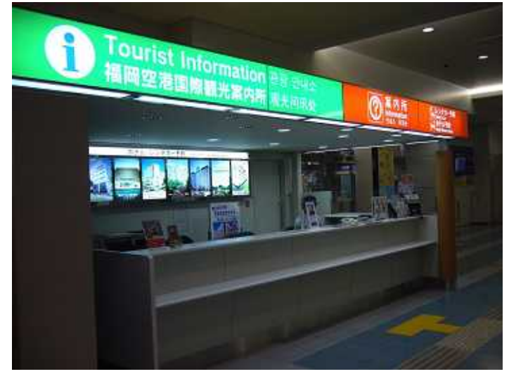
Information in English and other languages is a key part to improving visitors' experiences in Japan

This has seen the number of such travel agencies in London increase from a mere 30 prior to the launch of the Visit Japan Campaign to over 130 today.