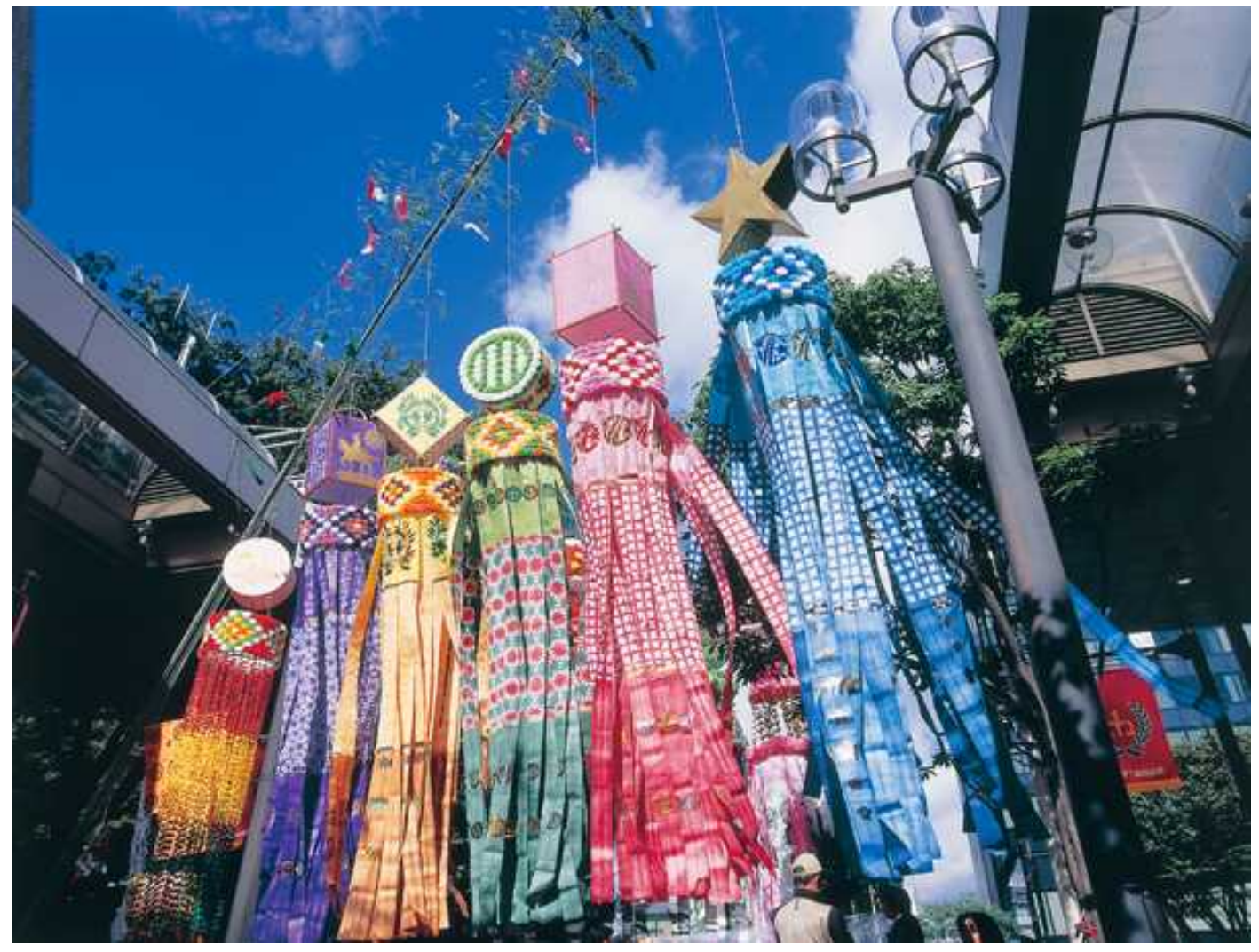
Tanabata Star-Festival, Sendai City