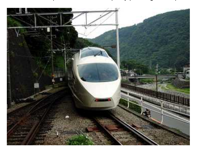
Odakyu Romancecar from Tokyo to Hakone Yuzawa near Mt Fuji, Kanagawa Prefecture

Fukushima Prefecture Strategic Tourism Office will bring together currently separate prefectural departments for tourism, airports and the prefectural produce strategy team, under the direction of the prefectural office for policy planning and airports.