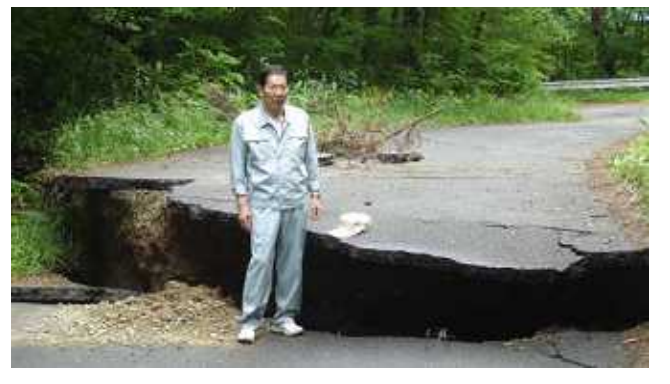
Damage to roads, picture from Kurihara City, Miyagi Prefecture.

The main functions of JLGC, London are to conduct research on local government in the UK and northern Europe, and to promote exchanges between individuals, including government officers and local government representatives in the UK and Japan. We are also involved in implementing the Japan Exchange and Teaching (JET) programme, which employs UK graduates in the fields of international exchange and English language education in Japan.