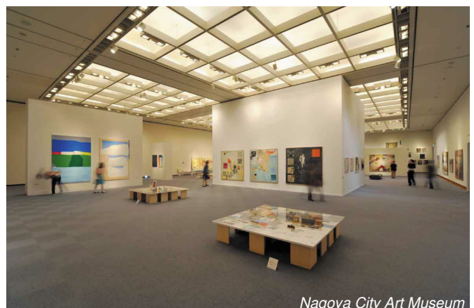
Nagoya City Art Museum