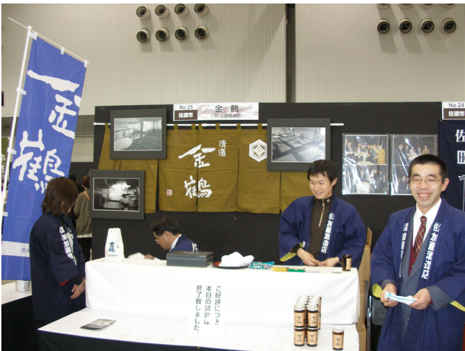
Sake producers from Sado Island marketing their produce at the annual Niigata prefectural Sake festival in Niigata City in April 2009.

Under national depopulation it is no longer possible for all areas of Japan to grow simultaneously; if one settlement grows in size it is a certainty that another will have to shrink in order to compensate.