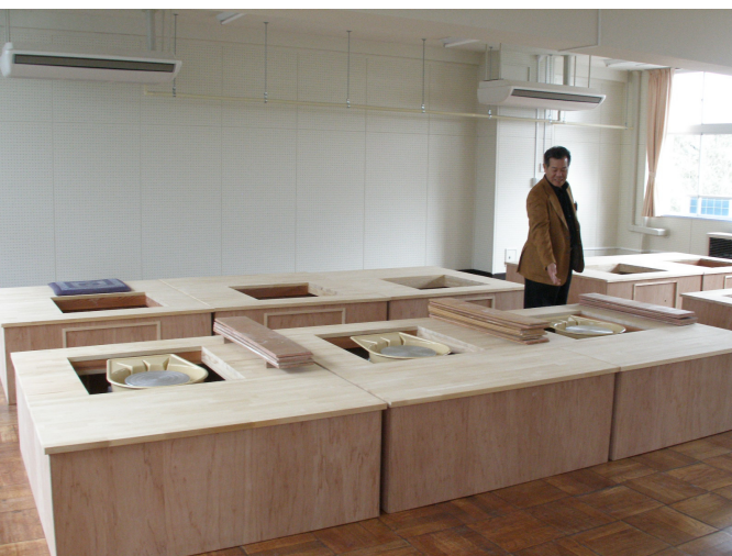
A lecturer shows off the new investment in teaching equipment for traditional crafts, in this case ceramic arts, at the newly opened NSG vocational college in Sado Island.

In a third example, local business leaders are coordinating their activities to reduce waste, reuse and recycle materials, and develop innovative business ideas that enhance community stability and sustainability, contribute to improving the quality of the natural and living environment in Sado, and provide better and more loving care for the elderly residents in the island. One such initiative is the establishment of Sado's first ever post-secondary educational institution, a vocational college teaching, among other things, environmental management, traditional architecture and crafts, and long term care for the elderly. These social and environmental entrepreneurs hope that the island's society can one day become an example for others in Japan's rural