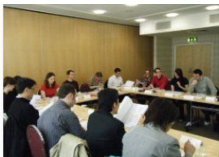
Top picture, JETAA Embassy reception 1990; picture above, JETAA UK AGM Cardiff 2010