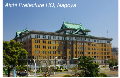
Aichi Prefecture HQ, Nagoya

rubbish tip. Nagoya citizens reduced their landfill waste by 60% in response to the threat, and the balance between industry and the environment is a topic of constant debate in the Prefecture.