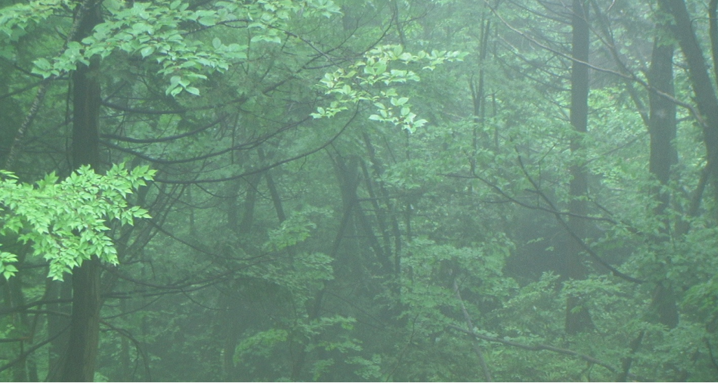
One of Japan's last remaining original growth temperate rain forests is in Sado Island, and tourism leaders are working hard to both protect their natural heritage as well as use it for sustainable tourism development.

In a second example, the Sado tourism association has begun organising weekend tours to one of the last remaining original growth temperate rain forests in Japan, located in the northern part of the island. Numbers are limited in order not to damage the sensitive ecosystem, and the tour is unusual in Japan since tourists must trek on foot, set up camp, and sleep in tents, before proceeding into the forest proper the next day; a far cry from the days of large tour groups travelling by bus and only stopping at view points for photos and souvenir hunting. Rather than seeking to attract as many tourists as possible, the tourism association and Sado City government want to attract fewer people who will each stay a little longer but encounter a greater range of experiences. This places less pressure on community resources and the natural environment, but also helps to maintain a more stable and sustainable tourist industry year round.